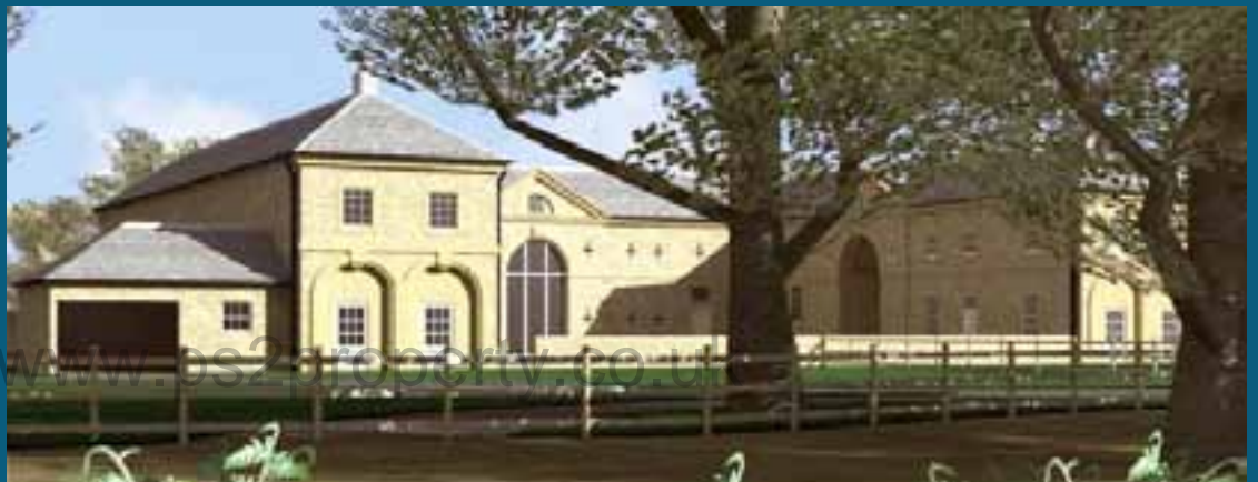
ARTISTS IMPRESSION OF COMPLETED DEVELOPMENT

LANGOLD STABLES GALLY KNIGHT ESTATE BARKER HADES ROAD LETWELL S81 8DG